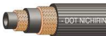
Low expansion type